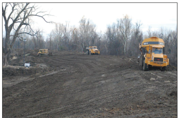
Crews reconstruct the levee at the center crevasse Dec. 3.