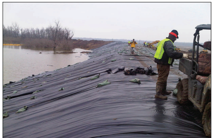
Newly-installed heavy plastic sheeting covers the levee at the center crevasse Tuesday. This view looks west.

The follow-on project to Operation "Make Safe", called Operation "Restore", will reconstruct the Floodway system to the pre-operational level of protection. The construction schedule is contingent on the availability of funding.