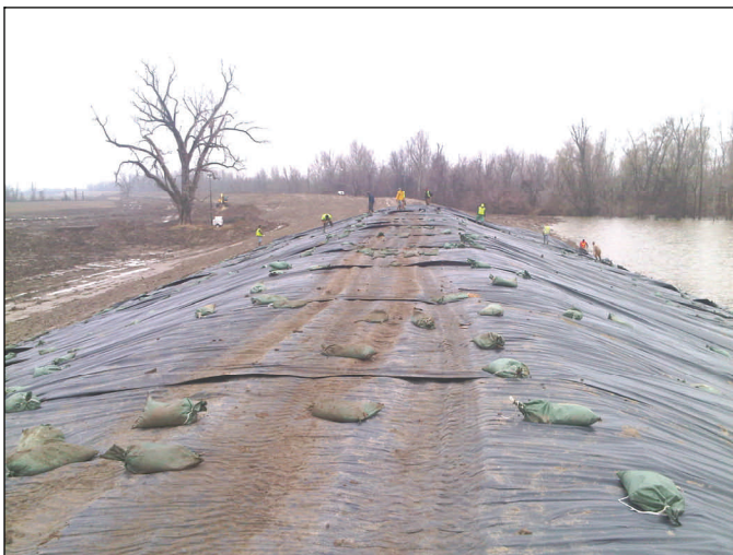
Crews cover the newly-constructed levee segment at the center crevasse with heavy plastic sheeting Tuesday. The plastic sheeting will help protect the levee against erosion caused by wave action and rainfall. This view looks east along the levee.